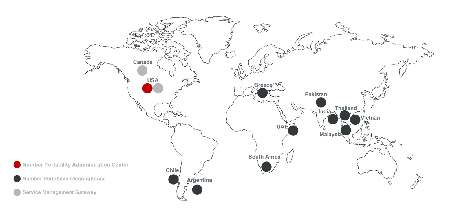
Figure 1: iconectiv numbering deployments