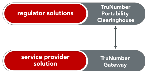
Figure 2: Deploy number portability and manage scarce numbering resources with iconectiv's Portability Clearinghouse. Easily comply with number portability requirements with our Gateway