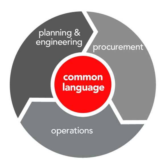
Figure 1: Common Language streamlines internal operations by enabling all units of a company to have access to centralized, standardized and accurate information on network equipment assets, equipment locations, and facilities.